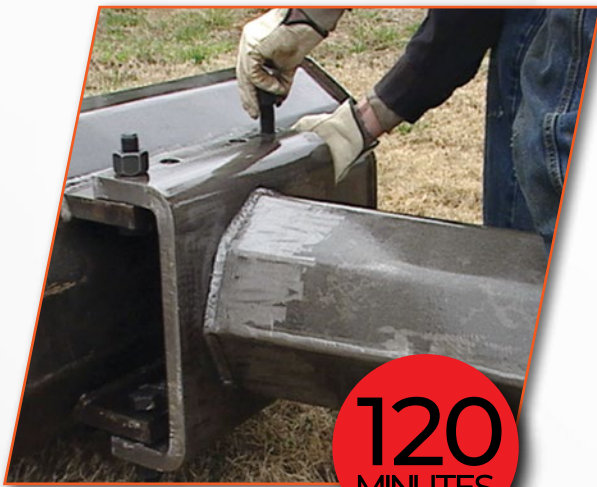
Traditional Bolted Connection

QUICKPIN™ connection installs in one-third the time of bolted connections