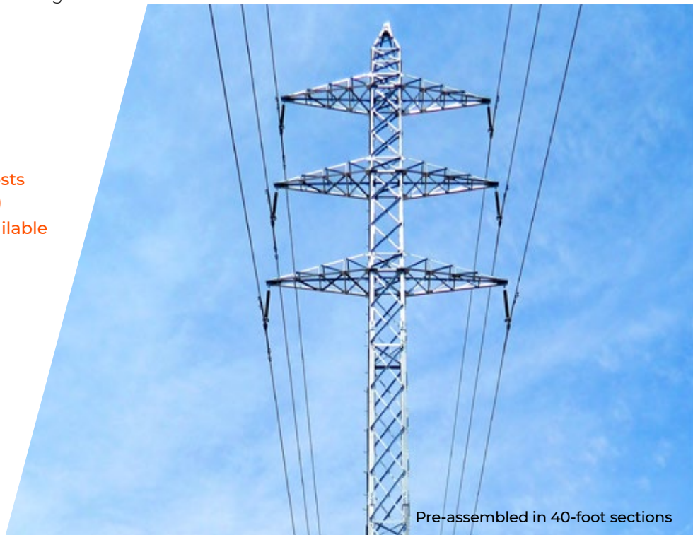
Pre-assembled in 40-foot sections